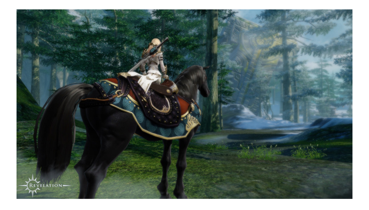
Download ->>> <a href="http://bit.ly/2SHQJ0B">http://bit.ly/2SHQJ0B</a>

Draft Day Sports: Pro Football 2019 License